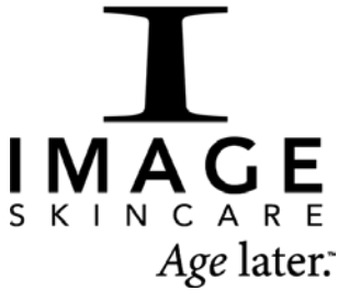
IMAGE SKINCARE is an evidence-based clinical skincare company, providing professional skincare products and effective skincare solutions. The most innovative brand in the industry, Image Skincare consistently produces the latest anti-aging, balancing, hydrating and illuminating technologies to further its mission of helping the world to Age Later.